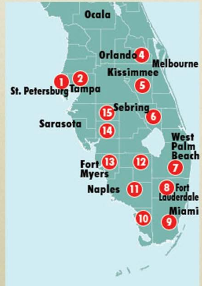
Hispanic diversity in Florida

Depending on where you live in the state, the largest group of Hispanics may be Mexicans, Puerto Ricans or Cubans.