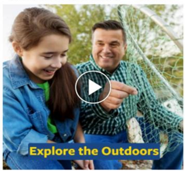
Social media ad

It's fun and easy to explore nature through fishing. Visit gonefishingpa.com to get started. You'll be cultivating a lifetime of ...See More