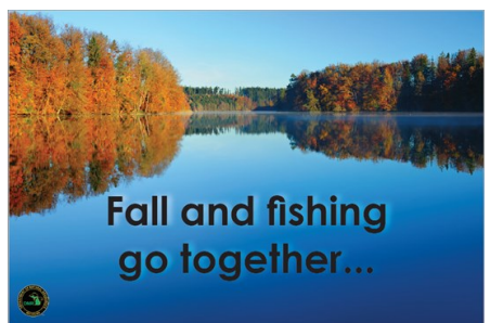
From top to bottom: email sent in April 2017, postcard sent in June 2017, postcard sent in September 2017