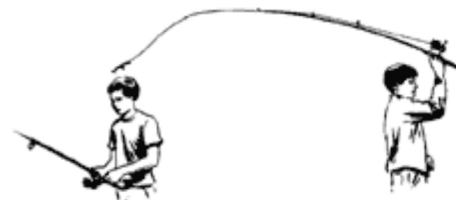
Look Before Casting

Content courtesy of the Future Fisherman Foundation