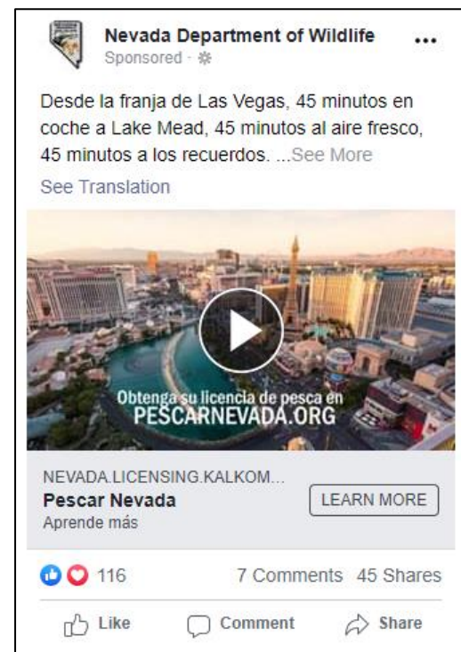
Social Media Post