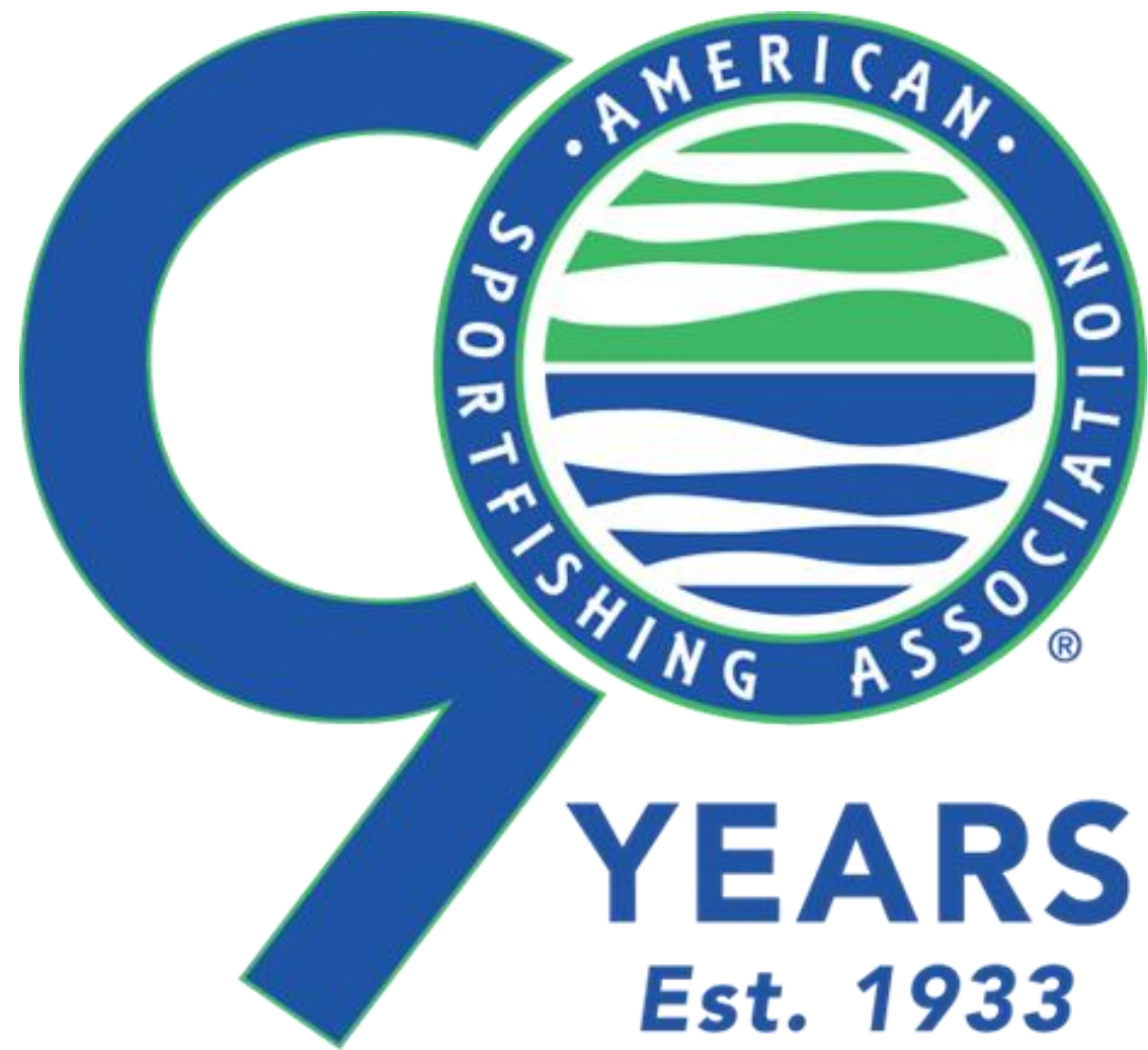
The Associated Fishing Tackle Manufacturers Washington D. C. June 30, 1933