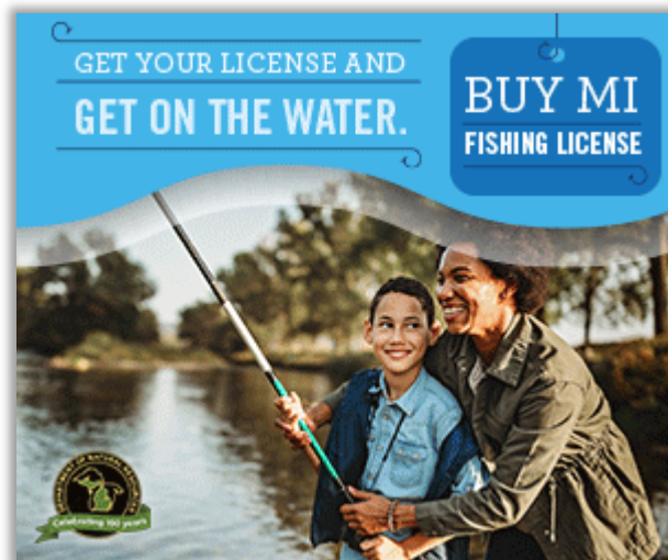
Digital Ad Example

MI DNR experienced issues with access to their data to properly track consumers. Consumers were sent to a landing page first (on Michigan.gov) and then to the E-License page (on a separate website). They were able to track how many people went to the landing page from the different sources and how many license sales came from the landing page. However, the tracking code wouldn't follow someone through the Michigan.gov site over to the E-License page.